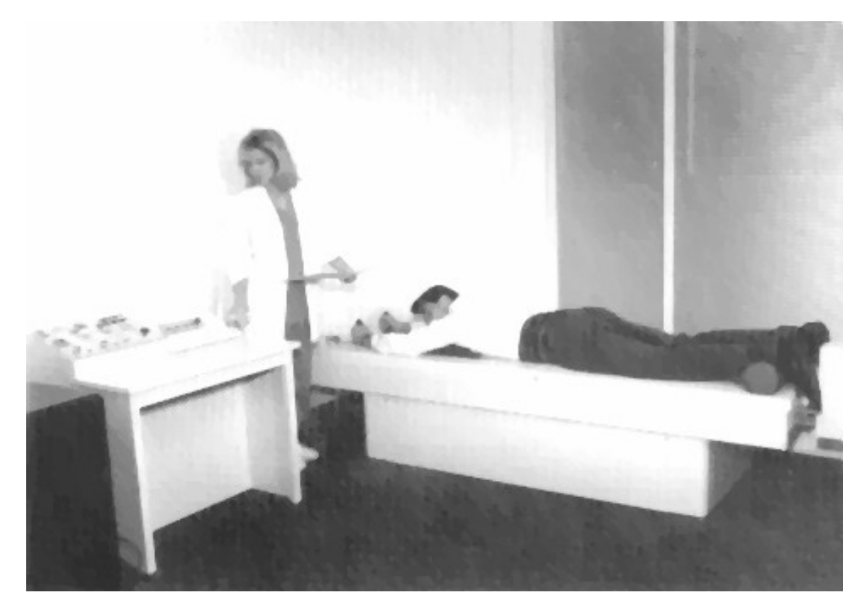
Figure 1: Patient undergoing treatment on the VAX-D Therapy Table

The blood supply to the nerve roots of the cauda equina is sensitive to compression. Even at pressures of only 5-10 mmHg, the flow in over 20% of the venules was completely stopped (6). Flow in all the capillaries stopped at pressures between 20 and 50 mmHg. A pressure of 30 mmHg is slightly less than one pound per square inch, so solute transport is easily reduced. Even vertebral distractions (increased separation) of 1 or 2 mm per disc would reduce ligamental redundancy and help to restore canal/foraminal patency, reduce venous congestion and increase axoplasmic flow. Furthermore, the effects of lumbar spine lengthening may be sustained for a period of time after lumbar distraction has been stopped.